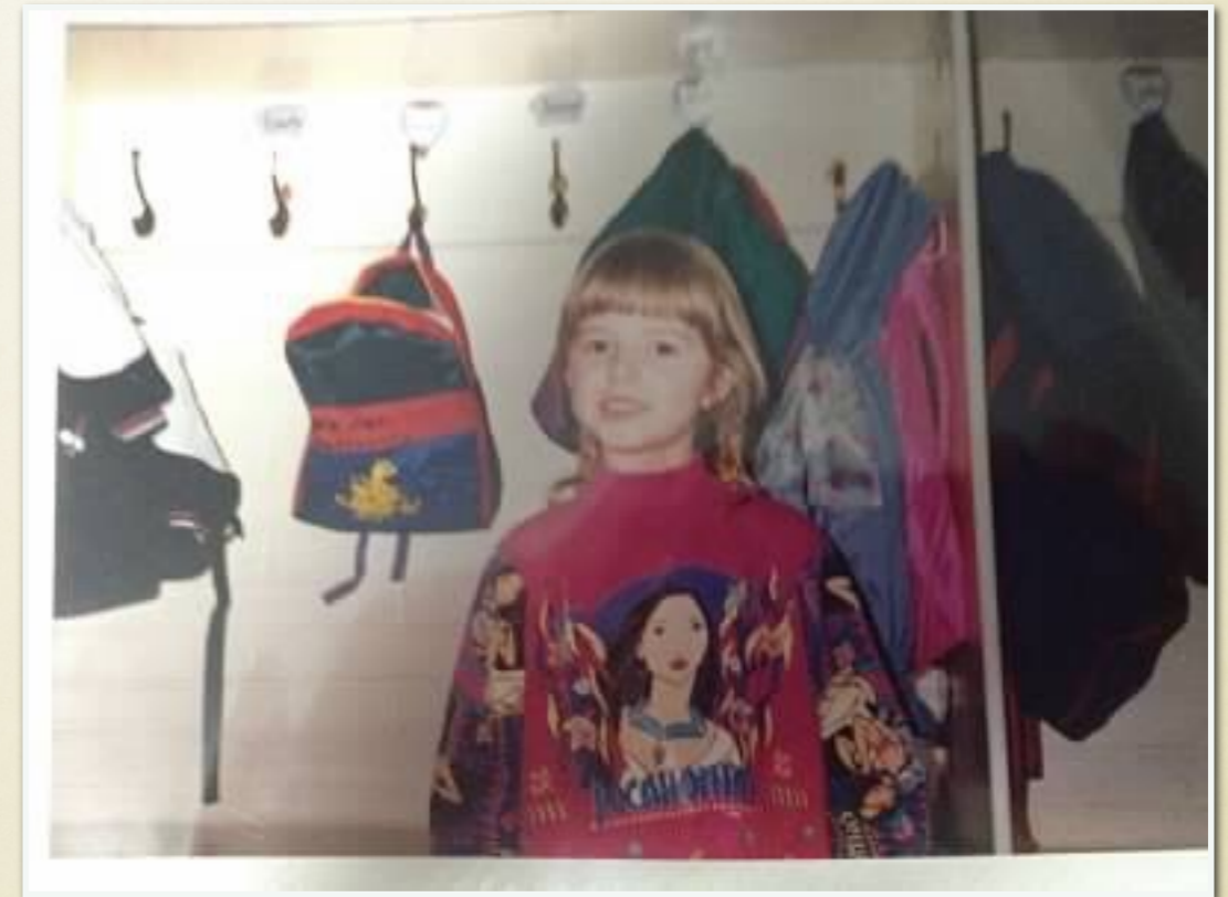
First day of Kindergarten