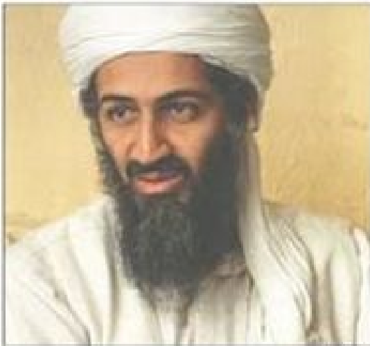
PUBLIC ENEMY: Bin Laden was also wanted by al-Qaeda's branchings of U.S. embassies in Tanzania and Kenya in 1998.

As the founder of al-Qaeda, bin Laden demonstrated the power and global reach of a terrorism campaign rooted in centuries-old Islamic beliefs and skilled in modern-day technologies. The militants he inspired have proved remarkably resilient, and the organization he established continues to pose a substantial threat to U.S. interests overseas.