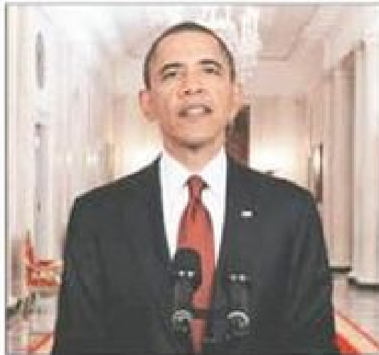
HISTORIC: Bin Laden's death will provide a clear moment of victory for Obama at a time of deep political turmoil overseas.

TEAM ATTACKED COMPOUND IN PAKISTAN WHERE HE WAS HIDING